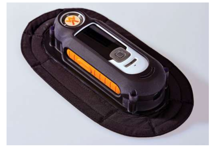
WA Clean is 7.8" x 4.7" (20 cm x 12 cm) in size and weighs only .5 lb (300 g). It can be used with or without a magnetic skirt.

Using these index figures, we now tell the machine what it is looking at using standard industry SSPC VIS 1 (ISO 8501-1) reference photographs. For example, if we know the surface to be SP10/NACE2 (Sa2.5) the index value is 65, the minimum value for that degree of cleanliness has been achieved. As we approach SP5 (Sa3), the index will be higher, say 80. Using these two values, the 65 is the minimum value for SP10 (Sa2.5) and the 80 is the maximum value before we transfer the surface to an SP5 (Sa3). As with the visual reference photographs, prior to any measurement, we also need to tell the WA Clean the starting rust grade, A/B/C/D.