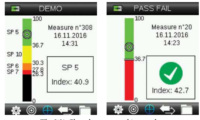
The WA Clean has two working modes: Cleanliness measurement (left) or PASS/FAIL (right).