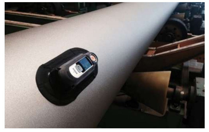
The WA Clean is ideal for pipe coating, rail and steel plate.

In Europe and Asia, visit wabrasives.com for contact information.